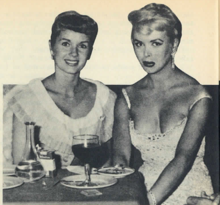
During the Rose Festival I met the fabulous Bardot but the thrill I felt vanished later when that oh, so gorgeous star, Debbie Reynolds, came to see me.

"It was a horrible awakening for me. My pains resembled those of birth!"