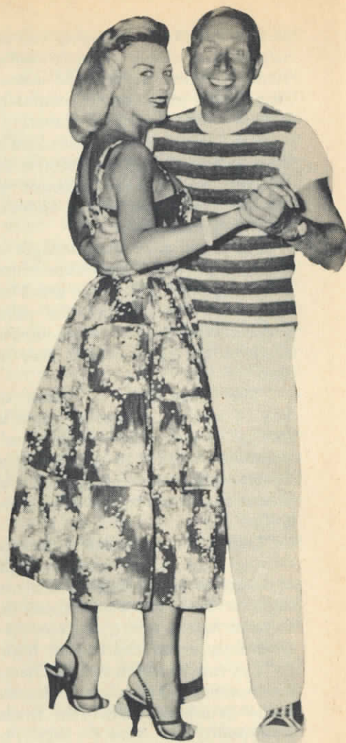
This photo holds poignant memories for me. It was taken just before Charles Trenet was in a crash.

Italian men are certainly not timid. They walk right up to women in the street, pay them compliments. On my first visit, it so upset me, that I didn't dare go out alone. I had friends call for me. Something else surprised me. Italian men are always in a group—so different from Frenchmen, or any others, for that matter. They're never alone with you, unless one has a "crush" on you that lasts a couple of weeks or a couple of months. No, when they are in an adventurous mood, they're always in a group.